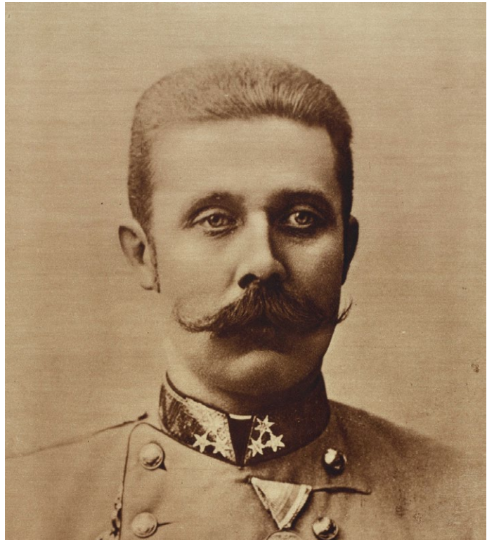
Archduke Franz Ferdinand

Germany declared war on Russia, and then, on 3 rd August 1914, they declared war on France. When Germany marched into France on 4 th August, Britain joined the war.