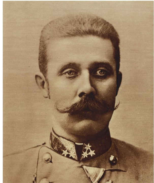
Archduke Franz Ferdinand

The start of the 1900s in Europe was quite peaceful for many countries. In the 1900s some European countries, mainly France and Britain, owned countries in Asia and Africa. These countries helped Europe to be richer and more powerful. The first major battle was the Battle of the Mons in Belgium.