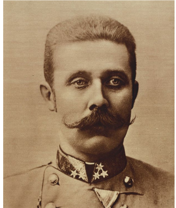
Archduke Franz Ferdinand

The first major battle of the First World War was the Battle of Mons in Belgium. This was the first battle between Britain and Germany and is when the First World War officially began for Britain.