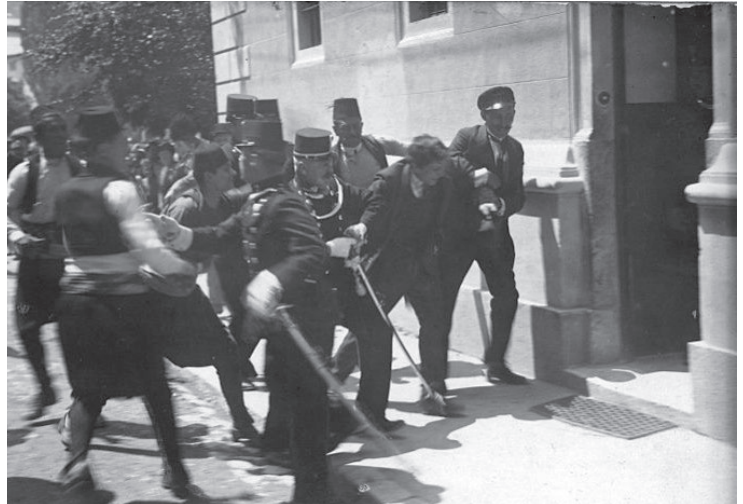
Picture associated with the arrest of Gavrilo Princip

Before the First World War, many countries were allies with one another and they had defence treaties. This meant that if war was declared on one of the countries, the other members of the alliance had to go to war to help them. There were two main alliances, one between Britain, France and Russia called 'The Triple Entente' and one between Germany and Austria-Hungary called 'The Central Powers'. One of the reasons for these treaties was that, during the early 1900s, each country wanted to be the most powerful. Germany in particular, who did not control many territories, began building warships as they wished to become the most powerful country. At this time, Britain saw what was happening and also began to spend lots of money on building large war ships. As more and more European countries began spending money on ships and armies, they decided to create these treaties to help defend one another if there was ever a war.